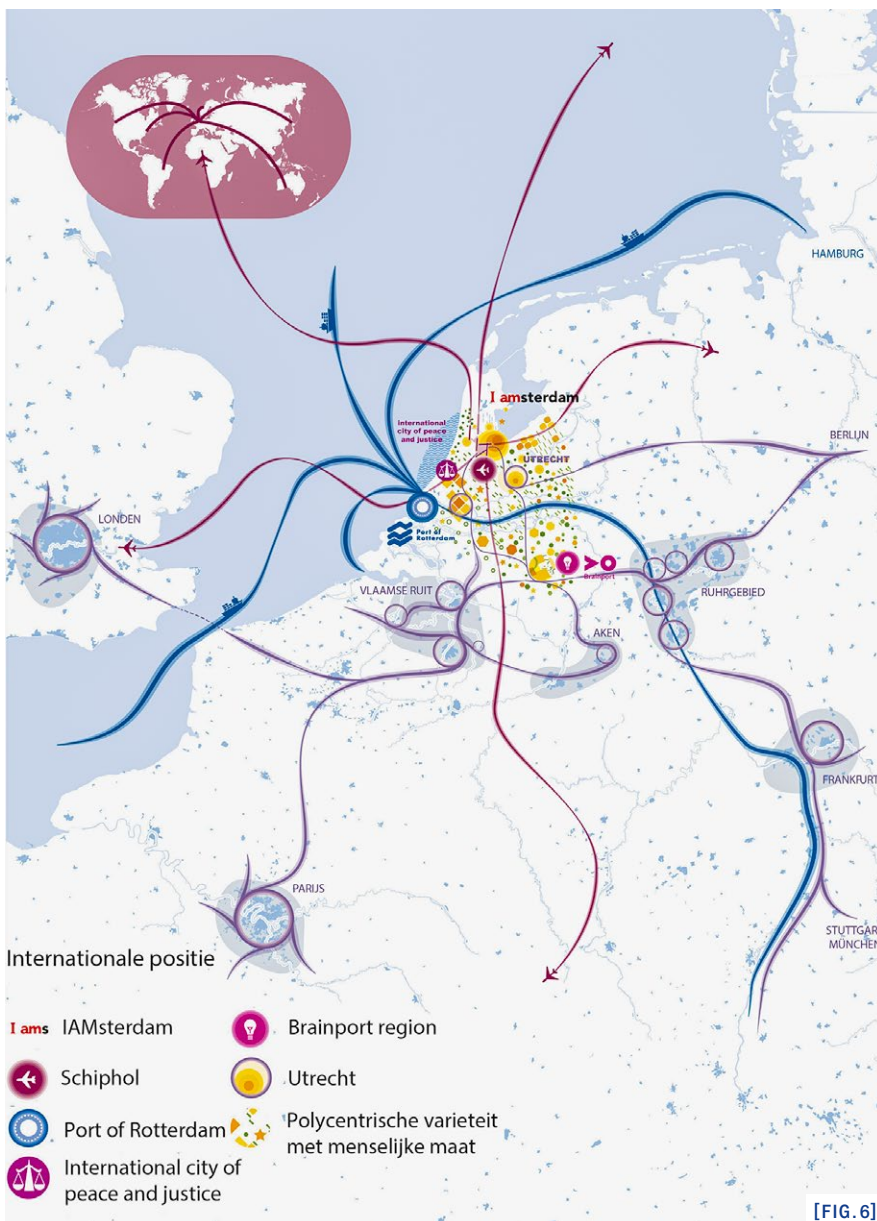
[FIG. 6] Visualisation of the international position and perspective of the Spatial-Economic Development Strategy of Amsterdam, The Hague, Rotterdam Utrecht and Eindhoven.

together», Hoekstra concludes, «a whole, strong, complete city surrounded by a wide range of quality-conscious and sustainable green villages, held together by a shared energy ambition and a developing regional energy economy.»