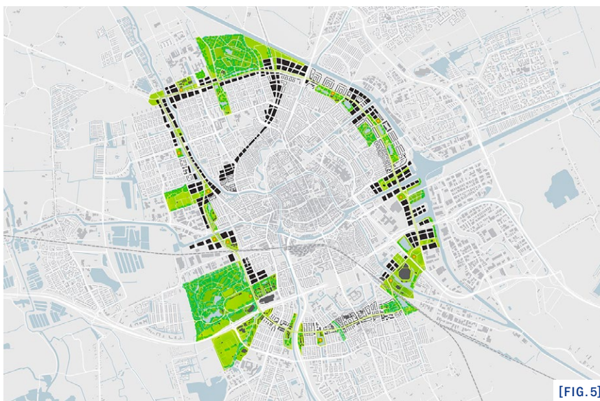
[FIG. 5] The networks of heat, electricity, and buffering can be combined with current ring road of Groningen. The ring structure forges the different urban districts together into a coherent urban environment, hence providing an urban development strategy for Groningen in the next decades.

social development and employment opportunities. Next to this, cities are the choice locations of productive, post-industrial and technological progress, entrepreneurship and creativity. Current preoccupations with climate change, mass migration and energy transition are constantly transforming both the urban landscape and the way that these cities can and need to be managed, planned and prepared for the future.